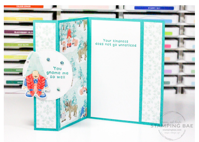
Card #4 Video