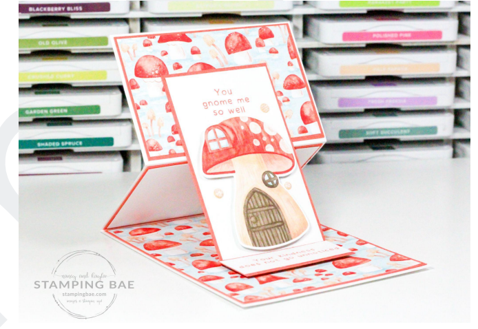
Card #2 Video