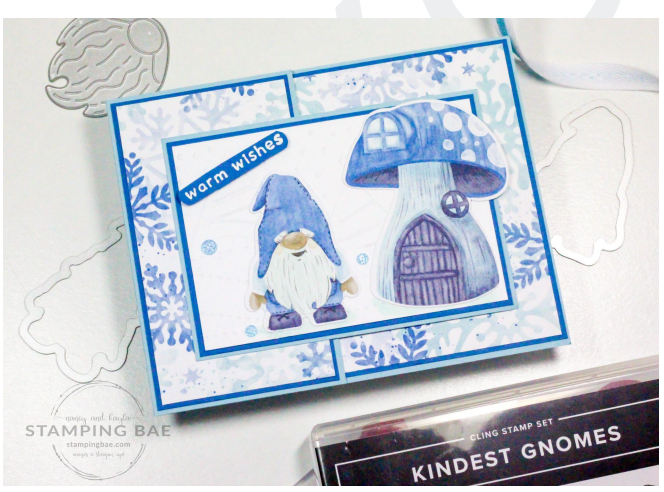
Card #3 Video